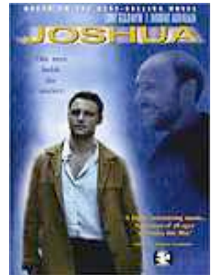
Epiphany Films presents Joshua starring Tony Goldwin and F. Murray Abraham

If you enjoy a good story, one that has a personal, biblical touch, rent or buy this film. "JOSHUA" by Epiphany Films will move your heart and soul.